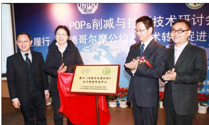
Opening ceremony of the China's Technology Transfer Promotion Centre

China's center for promoting the transfer of POPs reduction and control technology (hereinafter abbreviated as TTPC) opened in Tsinghua University, Beijing, China on December 29, 2011. The ceremony was co-organized by the Foreign Economic Cooperation Office at the Ministry of Environmental Protection of China (FECO/MEP), the School of Environment of Tsinghua University (THU), CSD (Beijing) Environmental Protection Development Co., Ltd (CSD) and the Stockholm Convention regional centre for Capacity-building and the Transfer of Technology in Asia and the Pacific (SCRCAP). The TTPC is established under the GEF project "Strengthening Institutions, Regulations and Enforcement (SIRE) Capacities for Effective and Efficient Implementation of the National Implementation Plan (NIP) in China" (hereinafter as SIRE project), and jointed operated by THU and CSD. About 50