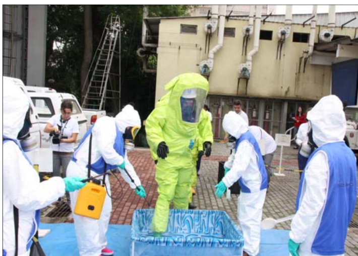
Simulation class at International Training Course

JICA, ABC and CETESB, as Regional Centre of the Stockholm Convention on POPs for the GRULAC Region and the executive partner of a trilateral project TCTP/JICA/ABC/CETESB, are conducting the "1 International Training Course on POPs Management". The course has been entirely developed, coordinated and implemented by CETESB's experts and was held at CETESB facilities in São Paulo, Brazil. Its objective is to promote the capacity-building and transfer of technology for relevant POPs issues. It is divided into three different modules: the first one was held from 9 to 27 January and it was attended by 43 decision-makers, regulatory authorities and experts from GRULAC countries, Brazilian States and CETESB' technicians. The participants were trained in urban health and ESM of solid waste, PCBs and