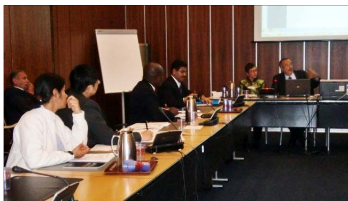
Experts discussion at the CRC-7 meeting

In this meeting, the Committee will review the draft Decision Guidance Documents for pentabromodiphenyl ether commercial mixtures, octabromodiphenyl ether commercial mixtures, perfluorooctane sulfonic acid, its salts and its precursor perfluorooctane sulfonyl fluoride and Gramoxone Super. OctaBDE commercial mixtures, PentaBDE commercial mixtures, and PFOS and related chemicals have also been reviewed by the Stockholm Convention's POPRC in the past. As an example of cooperation and information exchange between the two Committees, CRC has used some of the documentation from POPRC on these chemicals in its evaluation during CRC-7 and in the inter-sessional process. After the review of the decision guidance