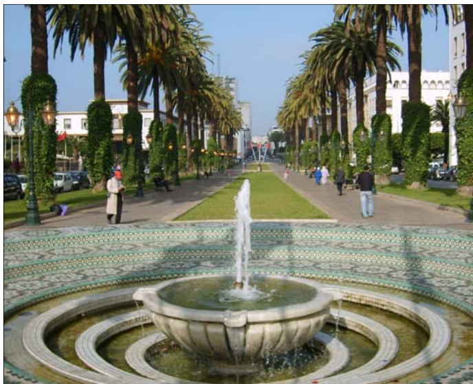
Mohammed V avenue in Rabat, Morocco

The Department of the Environment in Morocco, in cooperation with the Arctic Monitoring and Assessment Programme (AMAP) and the Regional Activity Centre for Cleaner Production (CPRAC) are organizing a workshop in Rabat on 13-15 March 2012 to develop the elements of a monitoring plan for persistent organic pollutants in Morocco. This will be developed in the framework of the Global Monitoring Plan prepared by the Stockholm Convention on POPs. Presentations by scientists experienced in the measurement of POPs concentrations in the atmosphere and humans will be followed by working groups to develop a simple monitoring program that can last over time.