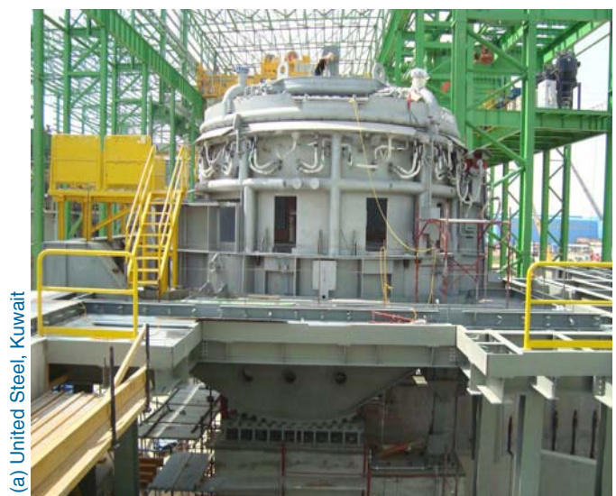
(a) United Steel, Kuwait