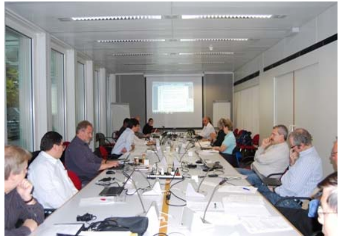
Presentations during the meeting

The meeting was also aimed at formulating policy recommendations to address coupled effects of climate change and POPs on the environment and human health. The final report of the expert group will be submitted to the fifth meeting of the Conference of the Parties to the Stockholm Convention to support the work on the effectiveness evaluation and the global monitoring plan for POPs.