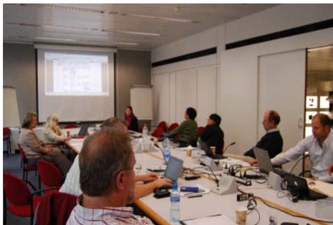
Expert group in the International Environment House conference room

The second meeting of the expert group to update the guidance on the Global Monitoring Plan (GMP) for POPs was held in Geneva, Switzerland, from 4 to 6 October 2010. Discussions focused on the ongoing revisions of a number of technical/analytical aspects of the guidance document reflecting the recent listing of nine new persistent organic pollutants in the annexes A, B and C to the Stockholm Convention.