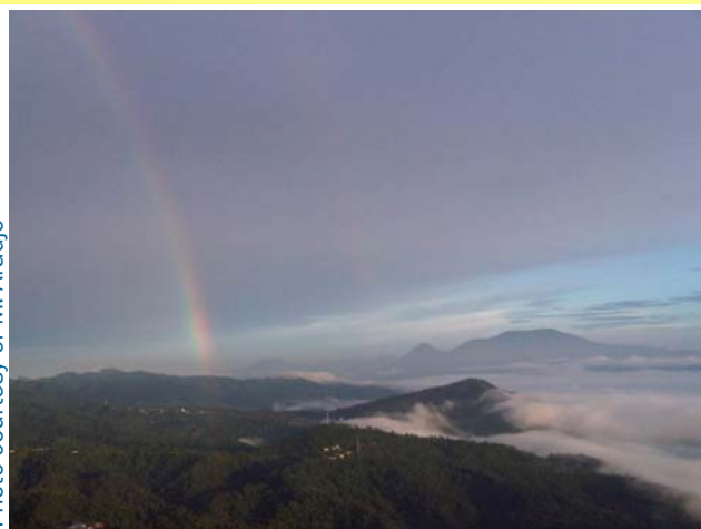
View from San Salvador