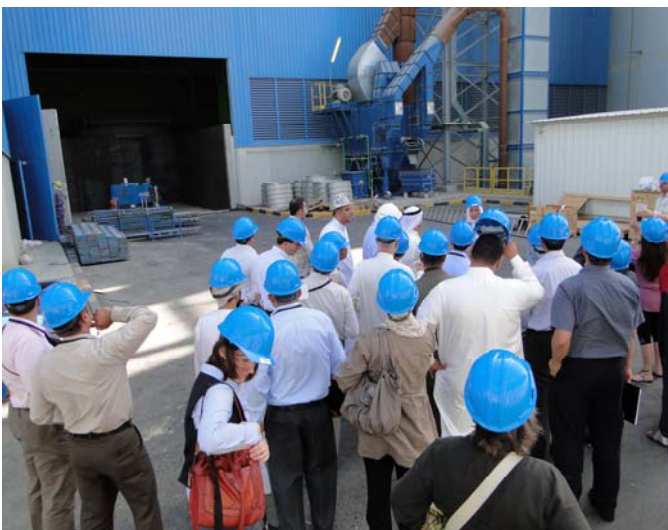
Participants visiting the steel manufacturing plant

For further information on the outcomes of the workshop, please visit : www.pops.int