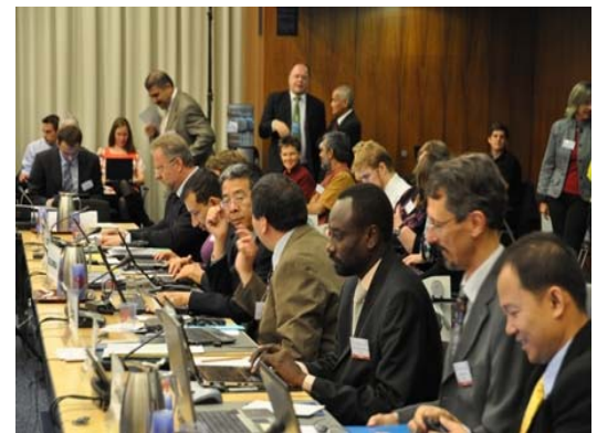
Experts during a plenary session

The Committee also finalized its guidance on alternatives to perfluorooctane sul-